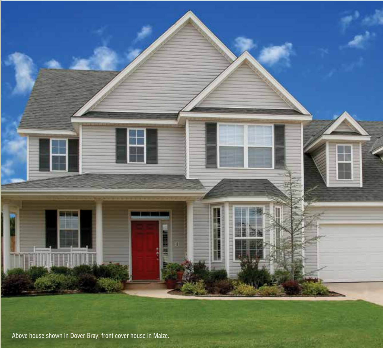
Above house shown in Dover Gray; front cover house in Maize.