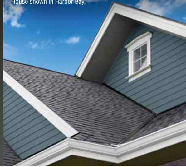
House shown in Harbor Bay.

Rolled nail hem for extra-strong wall attachment.**