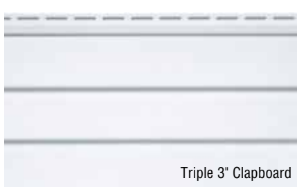
Triple 3" Clapboard