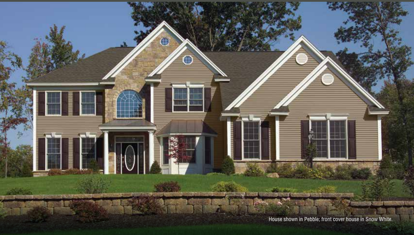
House shown in Pebble; front cover house in Snow White.

Certain to draw admiring glances, Amherst vinyl siding presents traditional charm and appeal in an easy-care exterior. The ample selection of architectural colors, inviting textures and authentic profile designs will let you achieve the ideal finish for your home.