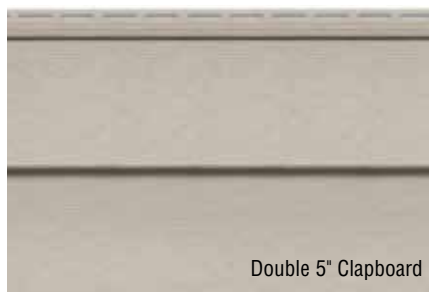
Double 5" Clapboard