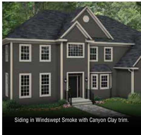
Siding in Windswept Smoke with Canyon Clay trim.