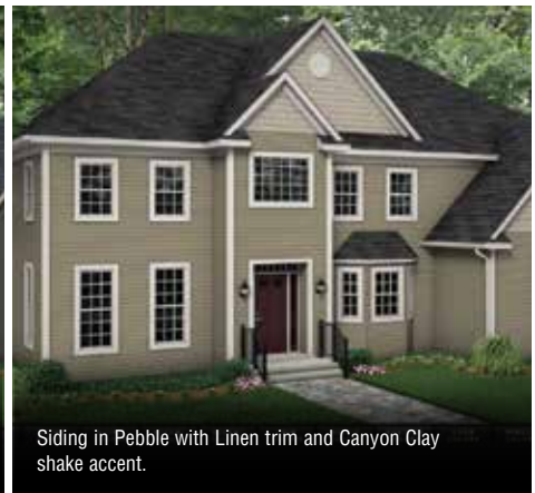
Siding in Pebble with Linen trim and Canyon Clay shake accent.