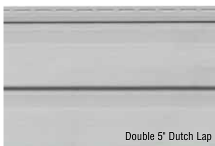
Double 5" Dutch Lap