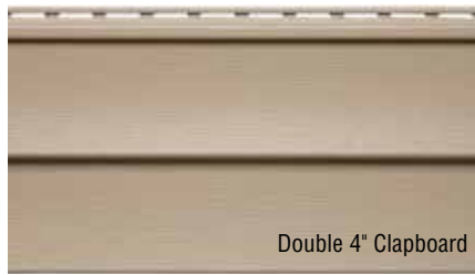
Double 4" Clapboard